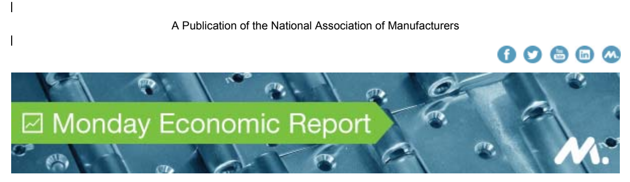
November 23, 2015