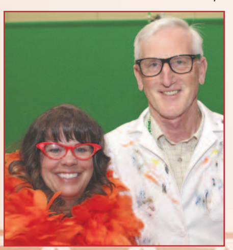
dees on the popular Hospitality Night which feature themes, interactive game and good food and drink.