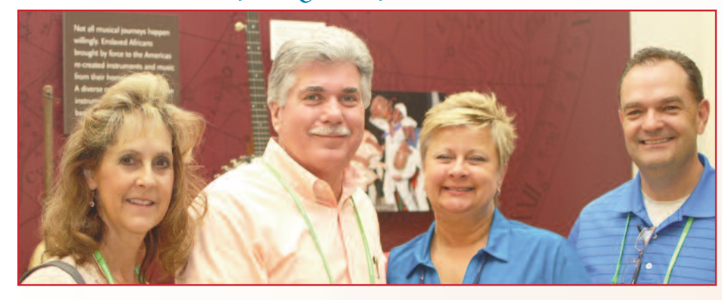
NAHAD members enjoy the Opening Reception at the Musical Instrument Museum