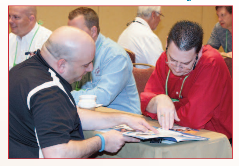
More than 100 NAHAD members took part in Speed Networking sessions on Sunday morning, April 27