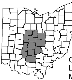
OHIO Location Map