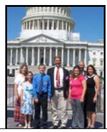
Taking a break in front of the U.S. Capitol.