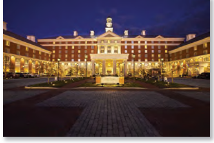
Hilton Columbus at Easton

Please note: the onsite registration fee will remain the same as the pre-registration fee of $125.00 for 1 person, $100 for additional persons.