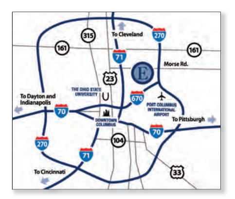
The Easton Town Center, 3900 Chagrin Drive Columbus, Ohio 43219 I-270, Easton Exit 33