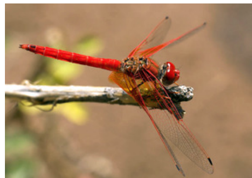
Dragonflies curb the mosquito population and serve as a symbol for malaria-containment efforts.

Malaria is a preventable disease. It has not been a problem in the United States for sixty years. What is needed are resources to address the issue. Lives can be saved by something as simple as long-lasting insecticidal bed nets. LMI will include a " Lutheran Nothing but Nets " emphasis. Much more information will be forthcoming in 2010 as LMI is launched in the Southern Ohio Synod. Please keep this ministry in your prayers.