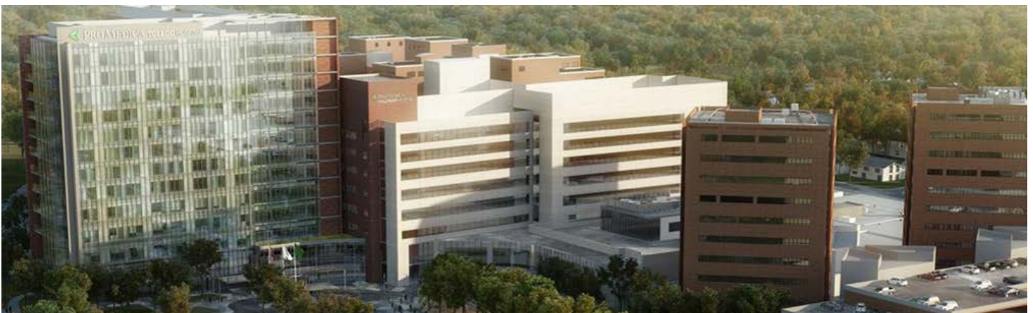
ProMedica Toledo Hospital Generations of Care, The Mannik & Smith Group

EEA Dinner and Gala Awards Program, Washington D.C.