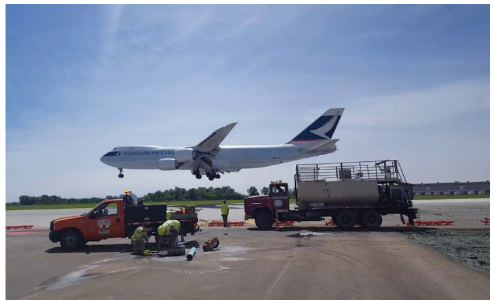
Rickenbacker International Airport Taxiway Rehabilitation and Modification of Standards Phase 1, Crawford, Murphy & Tilly

Reference to any other awards earned by the project in any materials submitted as part of the entry is not permitted.