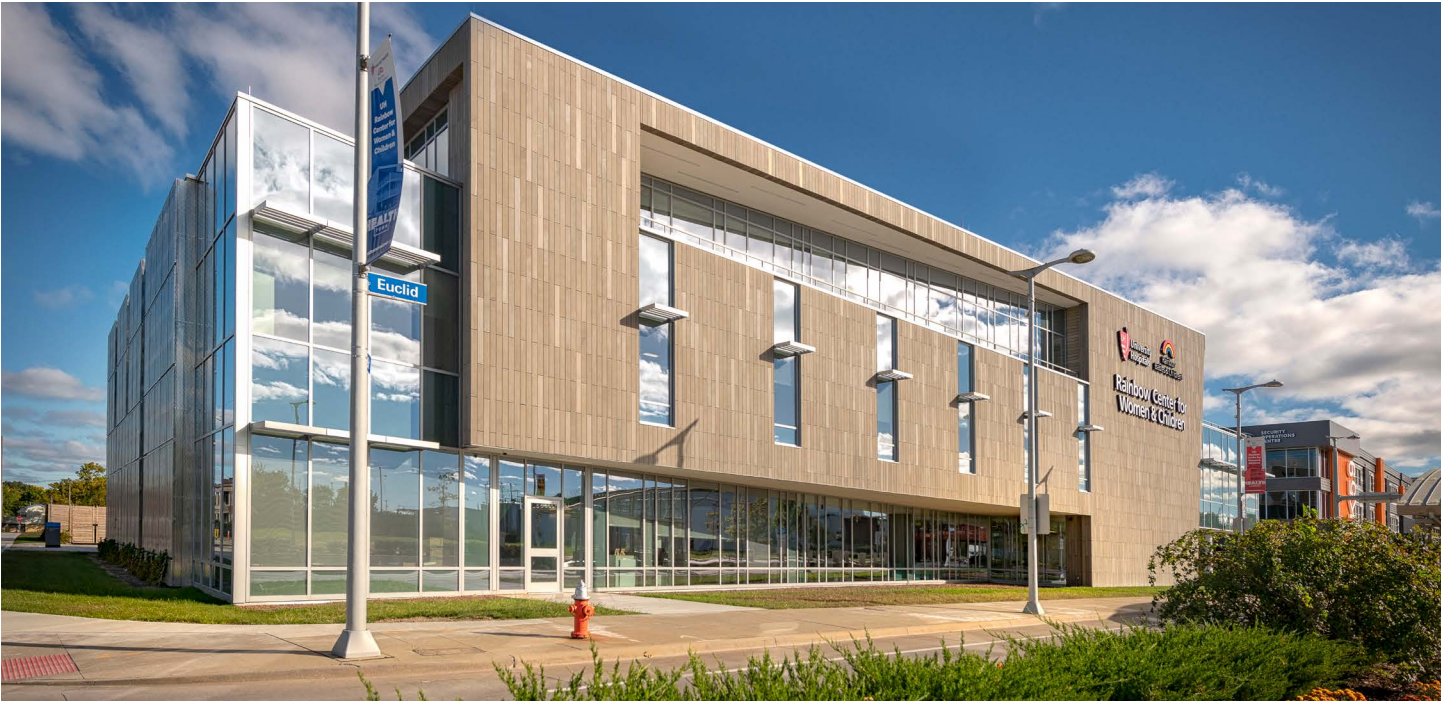
Rainbow Center for Women and Children, Karpinski Engineering