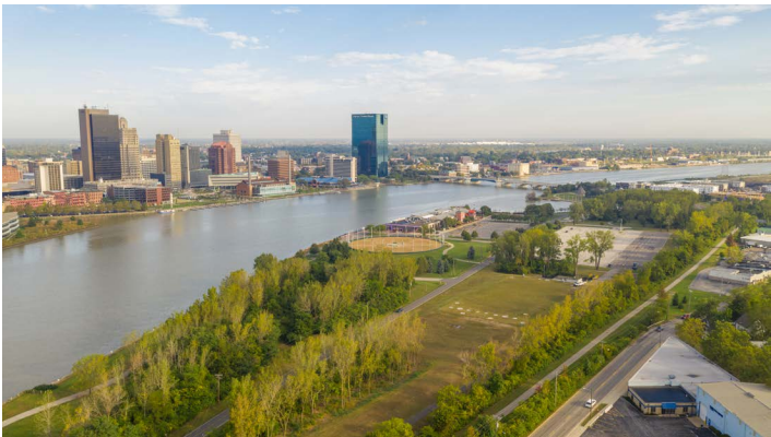
International Park CSO Basin, Jones & Henry Engineers

Entry rules and guidelines for the ACEC National competition can be downloaded here .