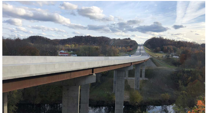
Southern Ohio Veterans Memorial Highway, ms consultants

Specifications: ALL documents must be in PDF format.