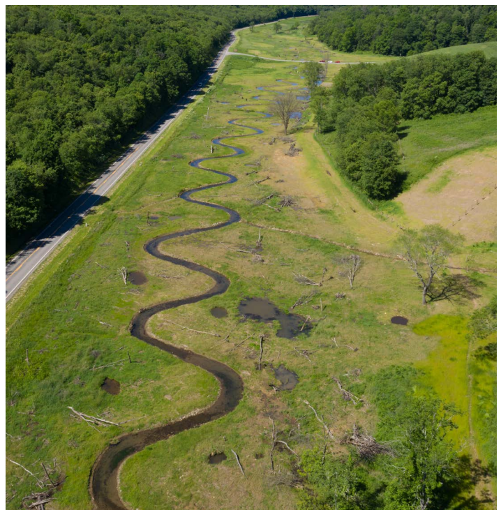
Faith Ranch Mitigation Bank, HULL & Associates