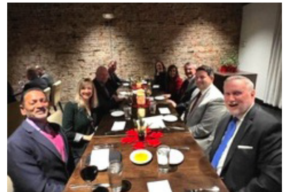
Senate Leadership Dinner December 12, 2023