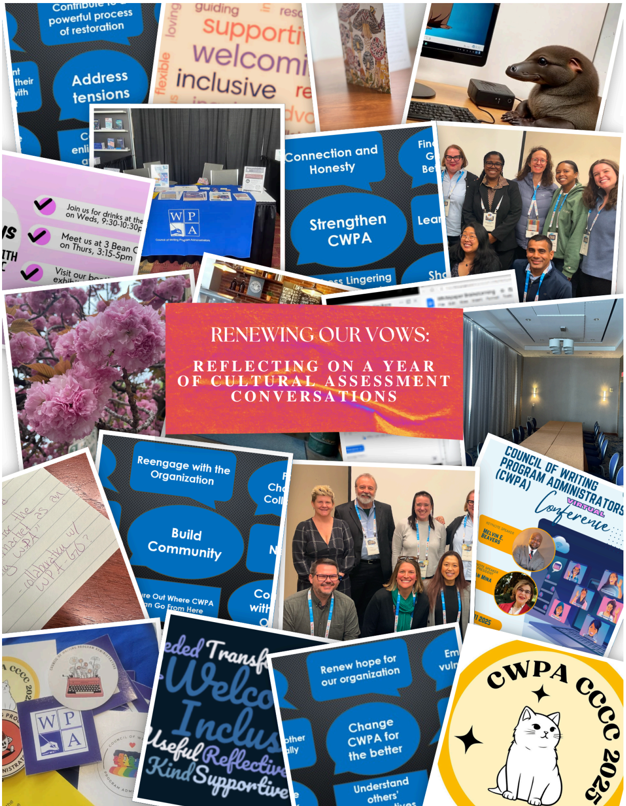
Image Description: The cover of this report is a collage composed of 20 smaller images from 2024-2025, including bubble maps of hopes for CWPA in black and blue, images of the Executive Board posing together at a conference, flowers, and a post-it with handwriting on it. At the center of the collage is the title of the report: "Renewing Our Vows: Reflecting on a Year of Cultural Assessment Conversations."