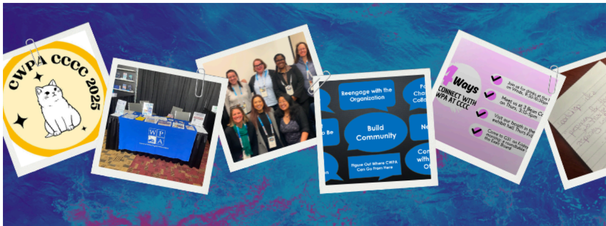
Image Description: This image shows six smaller images framed like square photographs, which are set against a bright blue and pink backdrop. The smaller images show the following from left to right: a sticker of a white cat with the words "CWPA CCCC 2025" above it, a picture of the CWPA table at a conference covered in handouts, a picture of half of the executive board smiling at a conference, a picture of quotes about hopes for CWPA ("Build Community" is legible at center), a graphic of a checklist with the headline "4 Ways to Connect with CWPA at CCCC," and a post-it with handwriting on it.