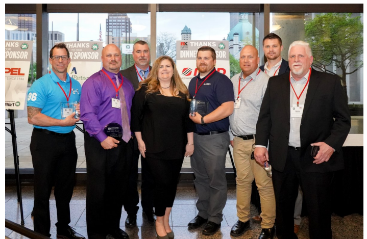
The MSD team at DBX Team Building Night 2019.