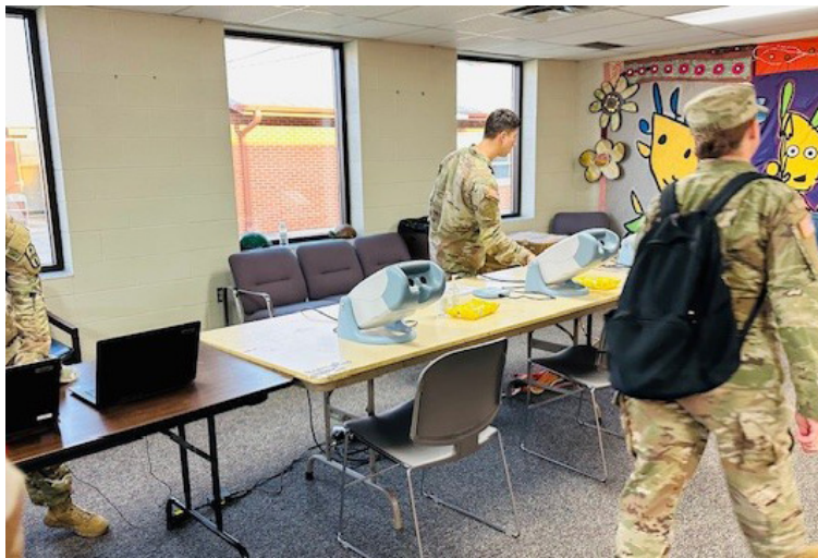
Guard Members setting up the vision screening station.