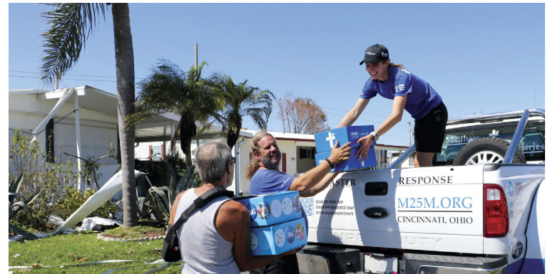
Matthew 25: Ministries in action.

www.fema.gov/sites/default/files/documents/fema_rd_pda-guide-summary-of-changes_07012025.pdf