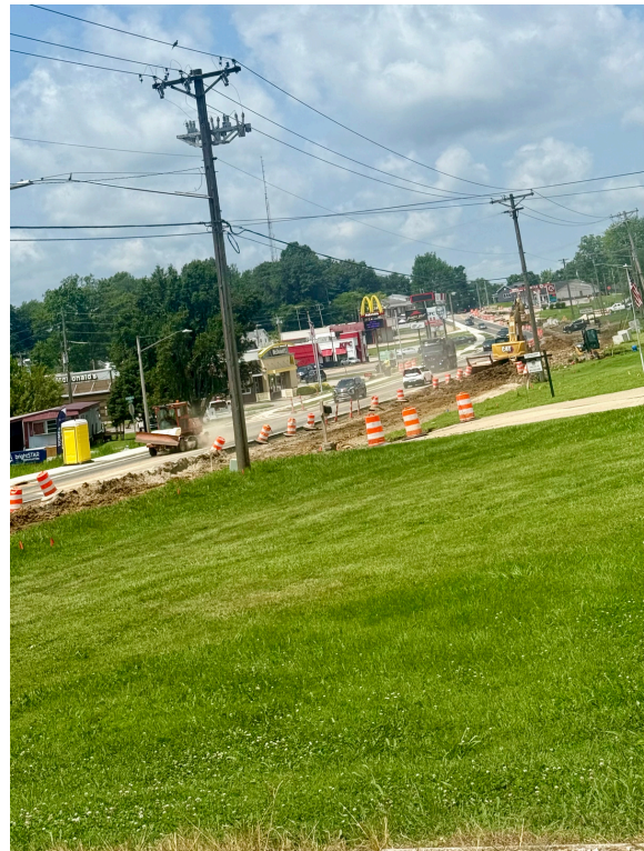
Highway 50 Project, Washington, In.