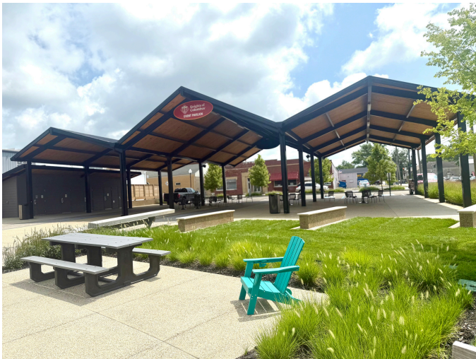
The Commons, Washington, In.