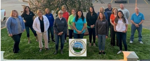
Washington Municipal Light & Power Office Staff