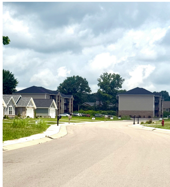
New Housing and Apartment Development Projects in Washington, In.