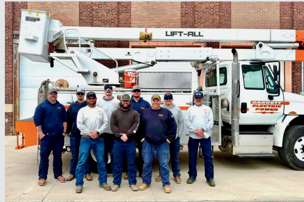
Garrett Electric Utility