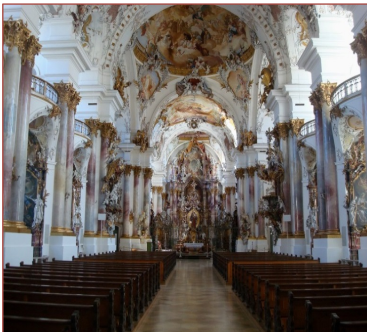
ZWIEFALTEN ABBEY CHURCH

3. A full day Journey into Swabian Art History: 59 € per person