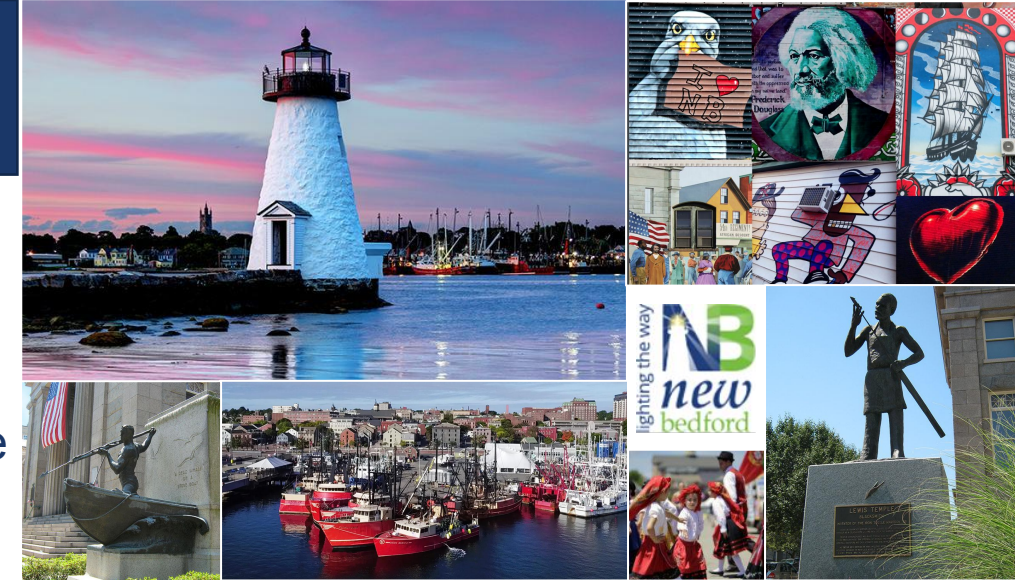
Historic | Fishing | Manufacturing | Cultural Diversity

Located in Southeastern MA, New Bedford is home to ~101,000 residents including ~10,000 undocumented immigrants.