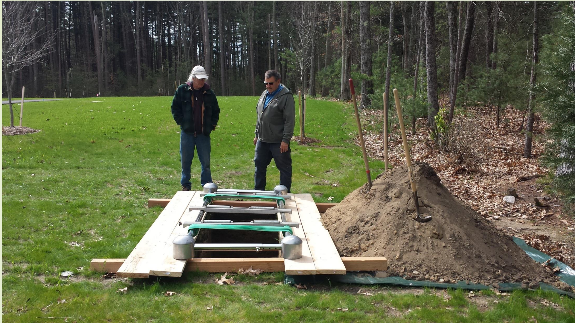
Cemetery Supervisor prepares for first green burial in new section. The lowering device will be used. Shovels are available for friends and family to backfill the grave if desired.