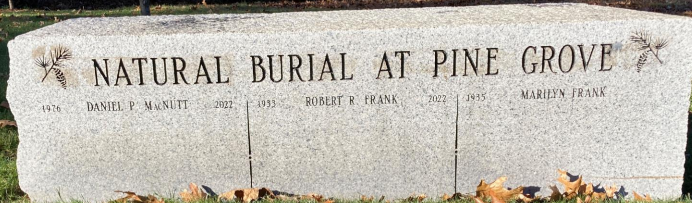
Community Memorial Stone