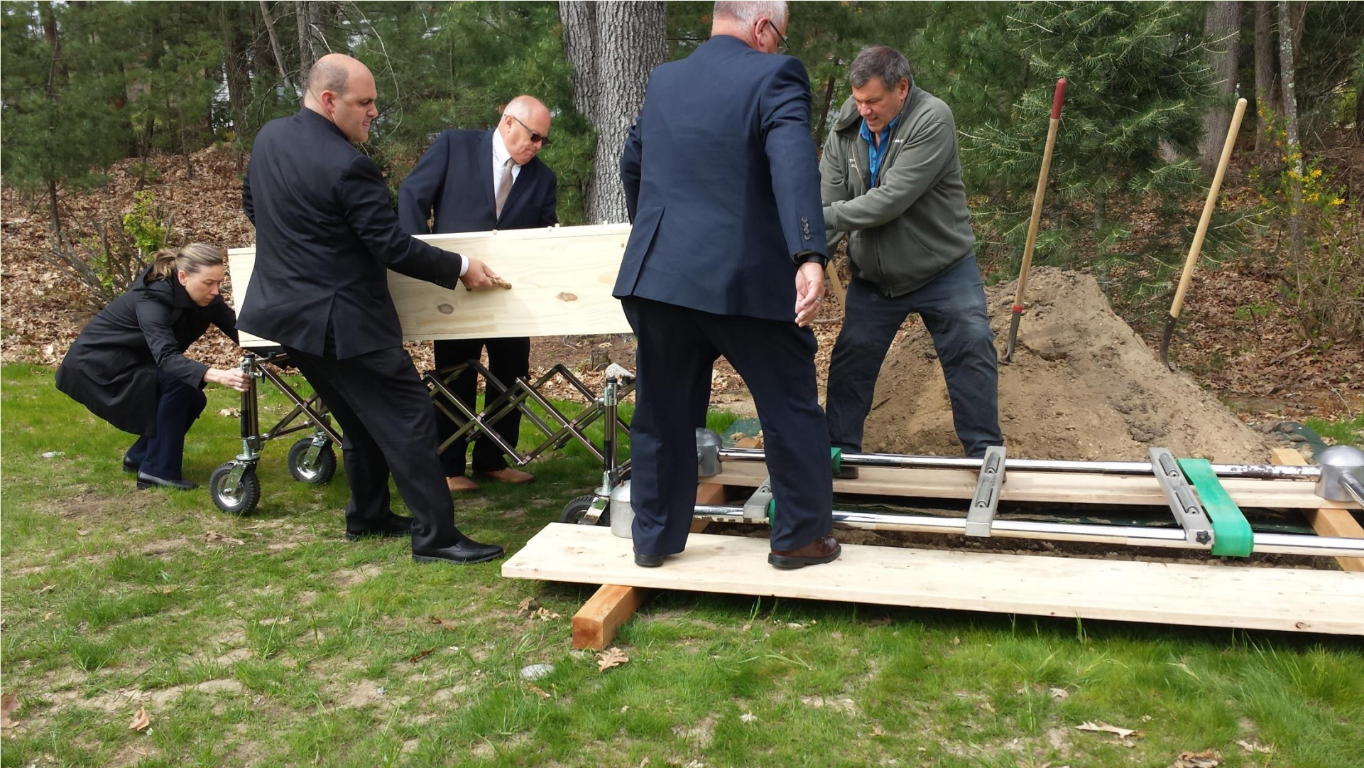
Casket moved to lowering device