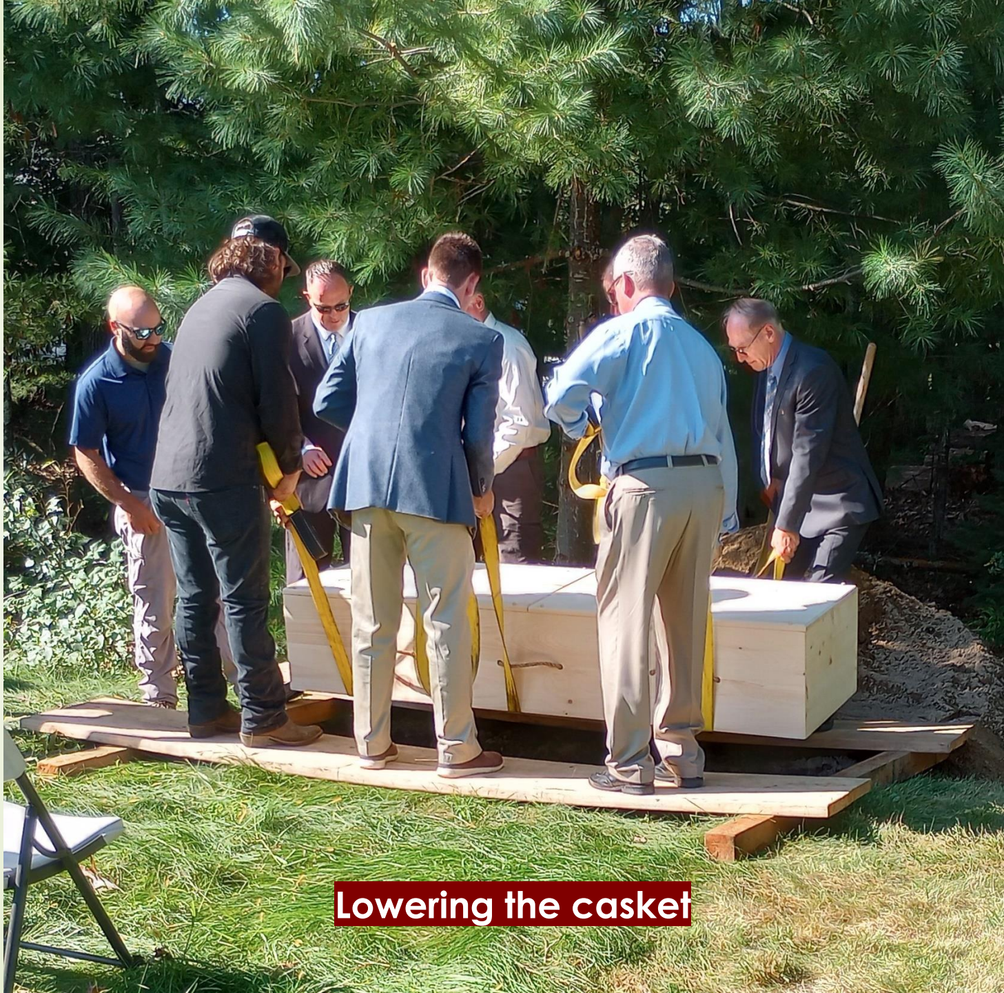
Lowering the casket