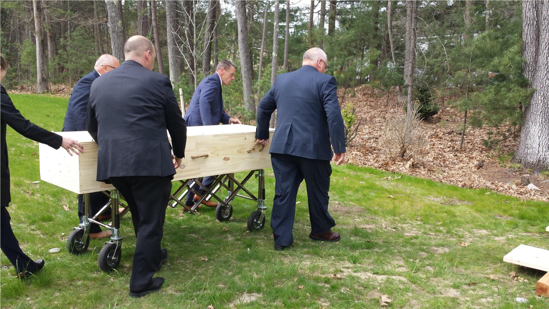
Funeral director and assistants transport casket from hearse to grave on rolling cart