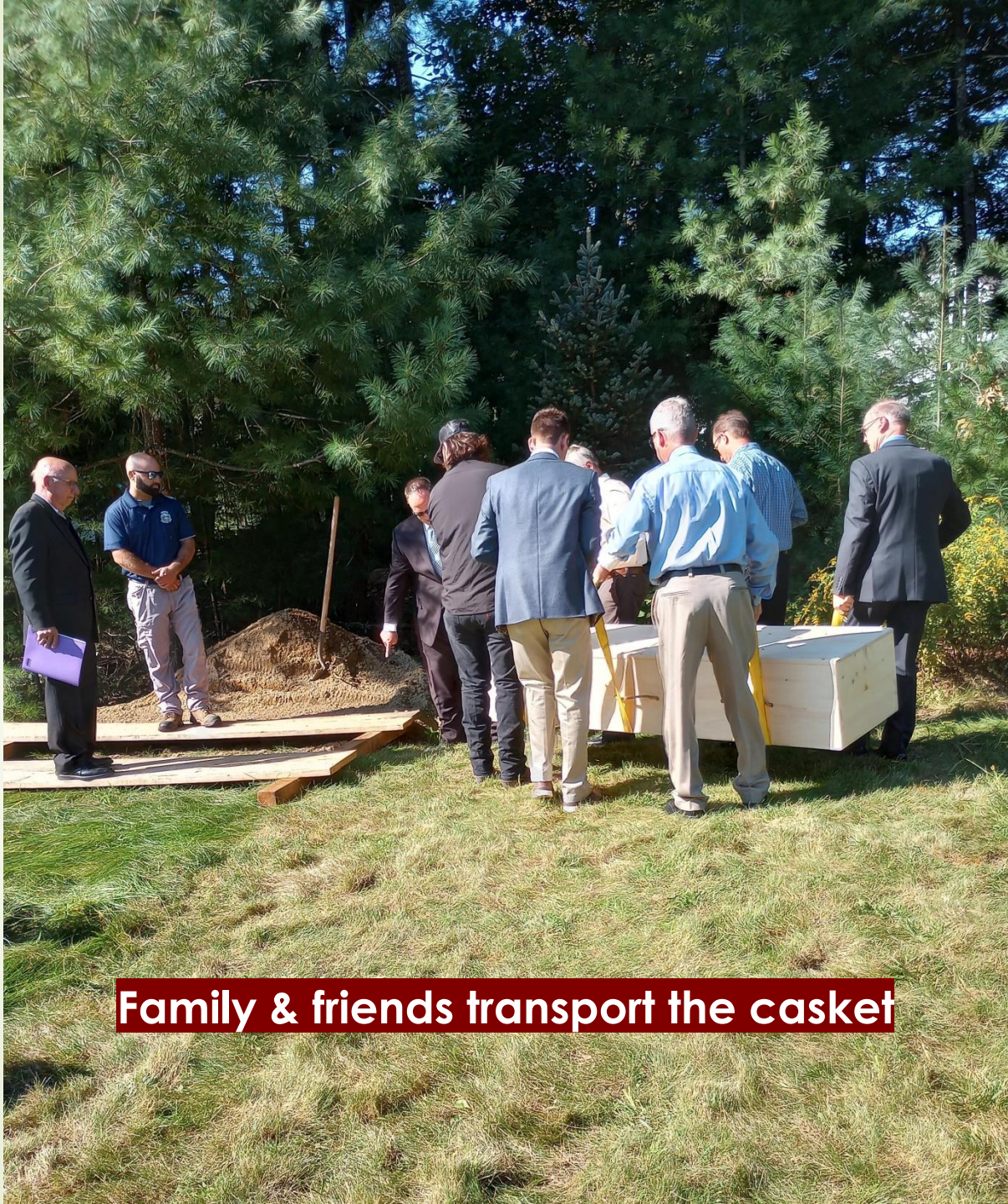
Family & friends transport the casket