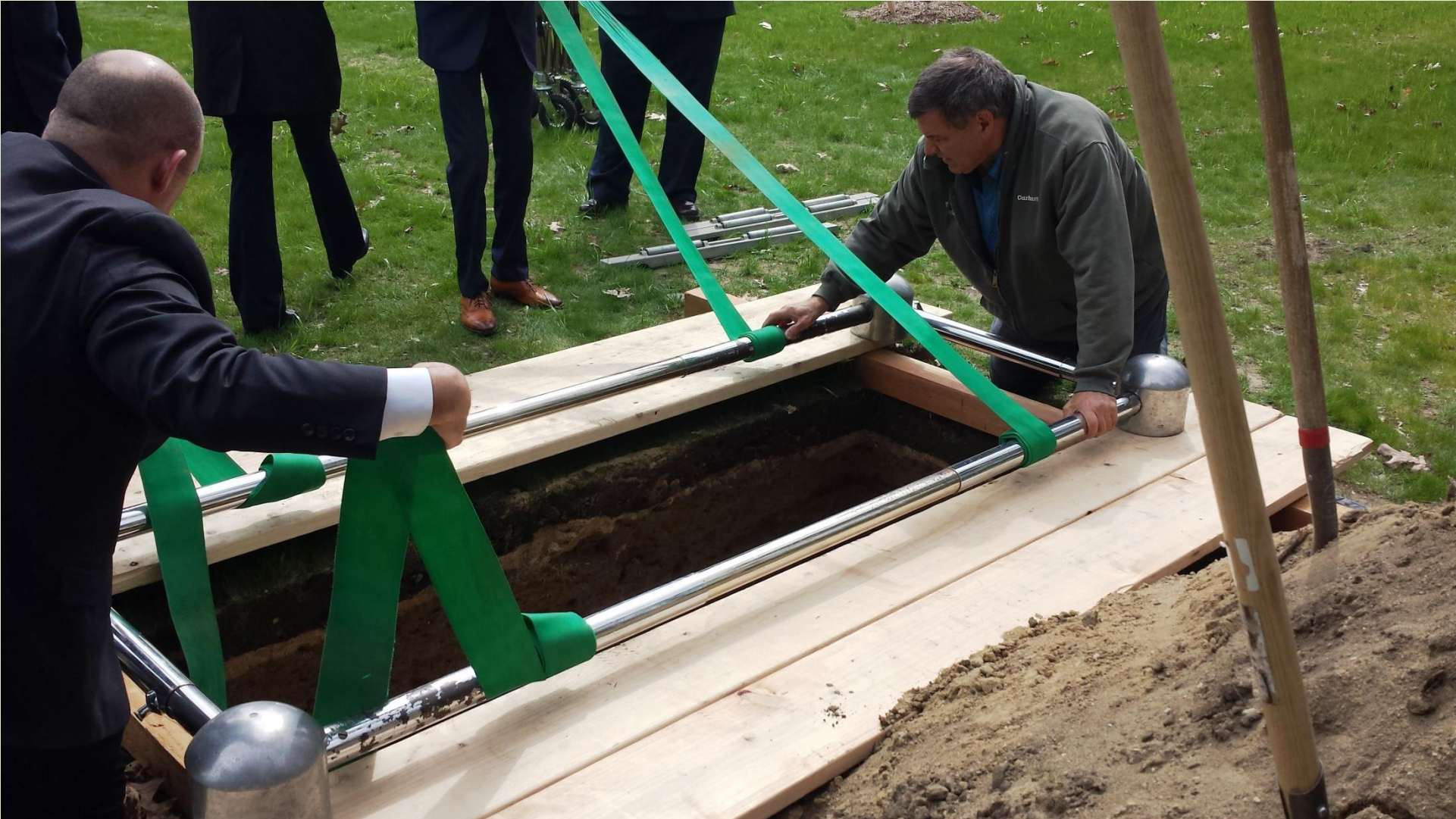
Casket has been lowered and straps now removed from under casket