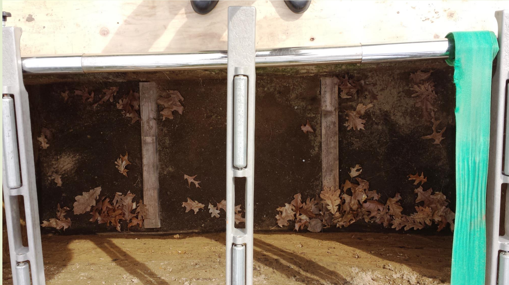
Two slats placed on grave floor as spacers so straps can be easily removed