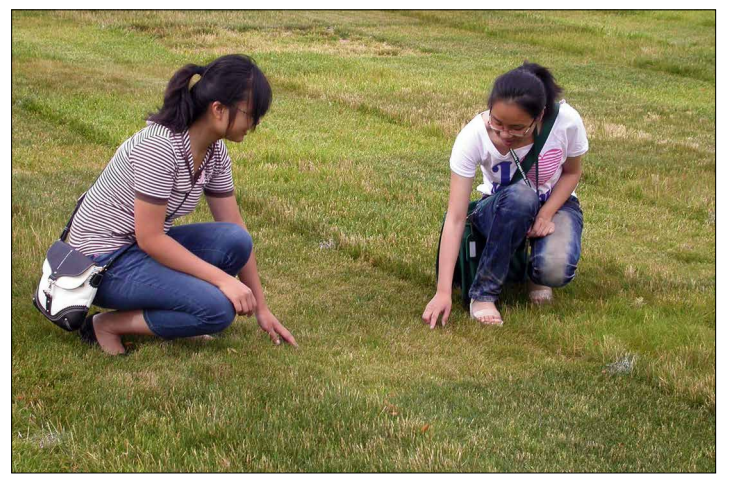
Lawns mowed at 3.5 or 4 inches out-compete weeds, tolerate grubs and look just as good as lawns mowed at 2.5 inches.

The highest setting on your mower! The top setting for most mowers gives a cutting height between 3.25 and 4 inches. This is best for your lawn, but at a setting of 4 inches you may sometimes see some "laying-over" of turf blades that some people find undesirable. For this