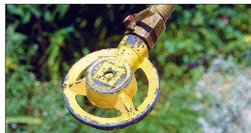
Rebecca Finneran, MSUE

Smart irrigation types are soaker hoses or drip irrigation systems, commonly combined with plastic mulch.