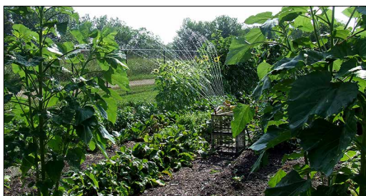
Rebecca Finneran, MSUE

Some years natural rainfall may supply all the moisture your vegetable garden needs. However, with seasonal variations of rainfall and temperature conditions, gardeners may wonder if they need to provide additional water, and if so, how much? One way to know is to use a rain gauge. Wide variations in weather patterns distribute uneven amounts of rainfall across a geographical area. Watch your local weather forecast for information on rainfall, or visit MSU's Enviroweather at www.enviroweather.msu.edu and check the station nearest you. Be aware if you are out-of-town, one site may receive little to no rainfall while another nearby site could receive a deluge. Using a measuring device like a rain gauge or even an empty can will help you know how much water your garden received while you were sleeping. The gauge should be near the garden where water splashing off pavement or overhangs won't affect the reading.