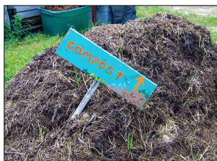
Rebecca Finneran, MSUE

Organic mulch such as straw, shredded leaves, bark or compost conserves water in your soil by shielding the ground from the hot rays that evaporates moisture. Organic mulches don't have to be thick to be effective. Using a layer 1-3 inches deep in between rows or beds will be sufficient for at least one year. Coarse, fibrous