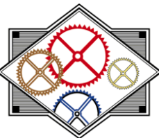
Engineering/ Manufacturing & Industrial Technology