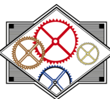
Engineering/ Manufacturing & Industrial Technology