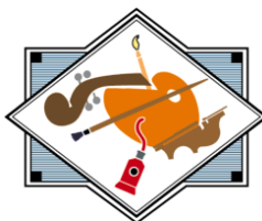
Arts & Communication