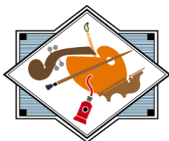
Arts & Communication