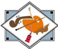
Arts & Communication