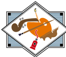
Arts & Communication