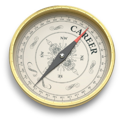
National Career Development Association