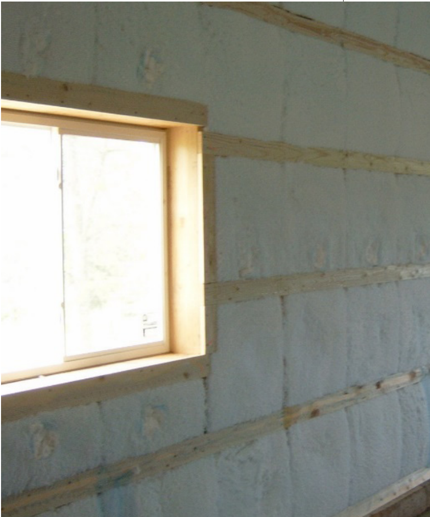
FIGURE 4. Insulating systems that take advantage of the full framing cavity may warrant special consideration in energy code compliance.

The building perimeter and under-slab insulation details are very important for several reasons. As Part I (Bohnhoff, 2010a) in Bohnhoff’s insulation series in Frame Building News pointed out, foundation insulation is important for preventing frost heave. In heated buildings in cold environments where frost heave can also