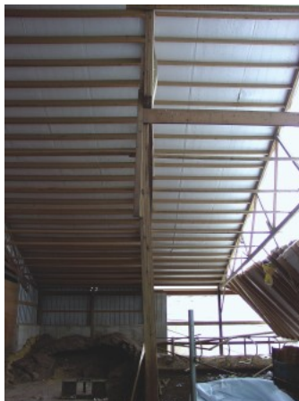
Figure 1: Buckling of a nail-laminated post due to improper design. Also visible is the buckling of the compression web chords due to improper bracing.

A prime example of the problems this causes was on full display in Myren's freestall barn and the other five failed buildings I visited the same day. Many of these buildings had seriously under-designed interior columns. As constructed, most of these columns would have an allowable axial design load of zero (0) which explains the classic buckling observed (figure 1). Other major deficiencies included no column sideways control at connections between interior columns and trusses, no accounting for additional loads induced by drifting snow and improper truss web bracing. With respect to the latter, all buildings I inspected with roof trusses utilized continuous lateral restraint (CLR) systems to brace longer compressive web members. Unfortunately, every CLR system was improperly installed, as none of them included diagonal bracing to prevent CLR shifting. This resulted in web buckling (figure 2) and subsequent truss failure.