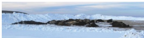
Figure 3: Relocated here are some of the 60 springing heifers killed in the partial collapse of a non-engineered post-frame building.

Keep in mind building codes establish minimum performance levels for buildings. Virtually all engineers will design their agricultural buildings so they just meet these minimum performance levels. Consequently, any statement implying that engineered agriculture buildings are over-designed is just not true.