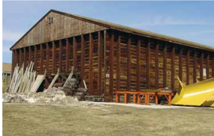
Figure 8. High wall pressures and resistance of wood to corrosion make post-frame the perfect application for salt storage facilities.