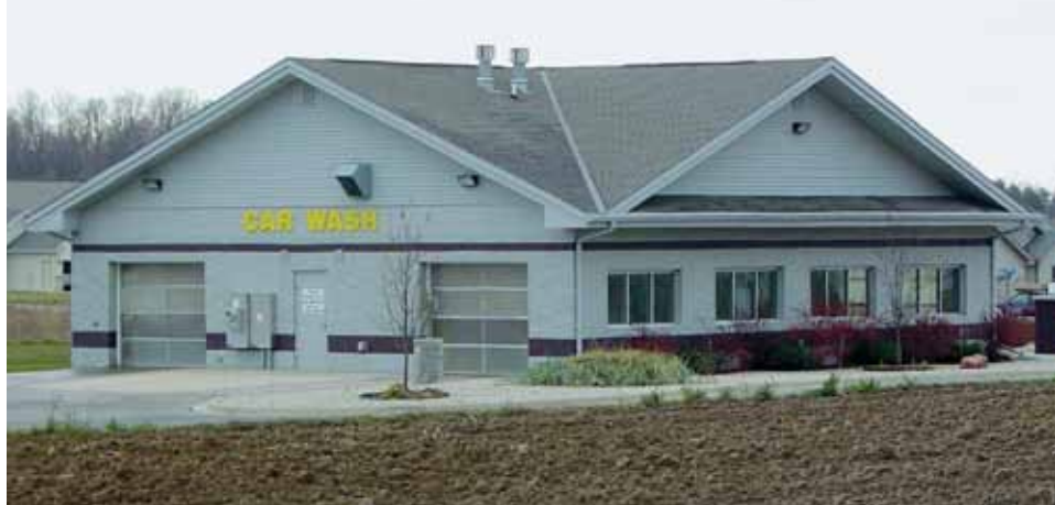
Figure 3. Post-frame easily accommodates the size and relative location of door and window openings in this building.