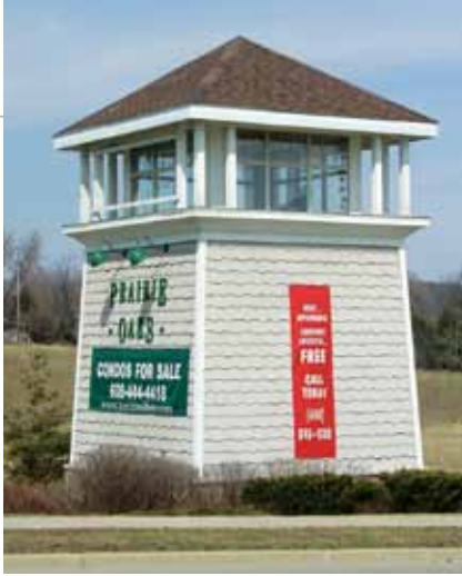
Figure 19b. Tower applications are ideal for post-frame.

hang height. Normally, post supports are used for lower overhangs because of headroom clearance issues when wall support brackets are used.