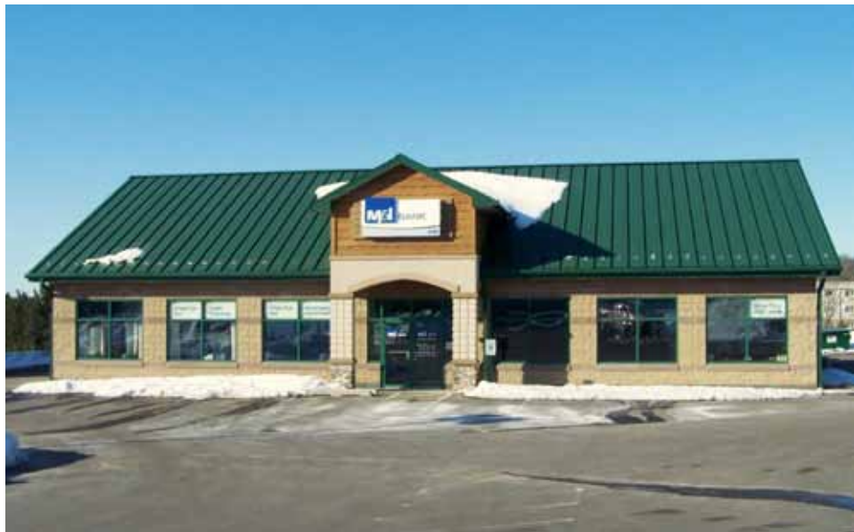
Figure 2. Large, equally spaced windows suit post-frame.