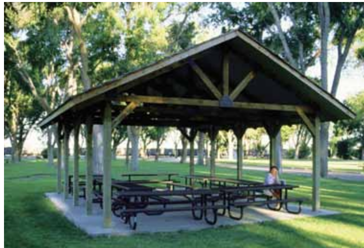
Figure 10. The desire for open sidewalls makes the post-frame building system a popular choice for park and other recreational shelters.