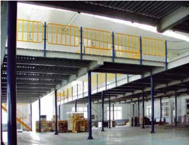
Figure 11. Post-supported floors and mezzanines and provide for more open floor plans.