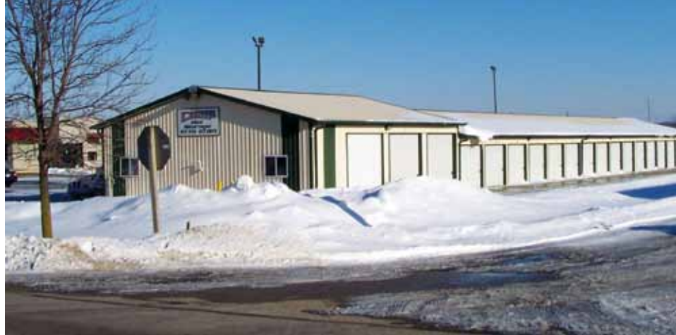
Figure 1. The numerous, equally-spaced overhead doors of min-warehouses make them ideal for post-frame.

In most post-frame buildings, almost every truss (or rafter) is directly attached to one or more wood posts. When a single truss is attached directly to posts, a large two-dimensional post-frame is formed. The connection of a series of