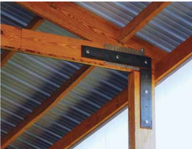
Figure 12. Truss resting on outer ply of a laminated post. Steel L-bracket placed on outer face of truss to help reinforce post-to-truss connection.