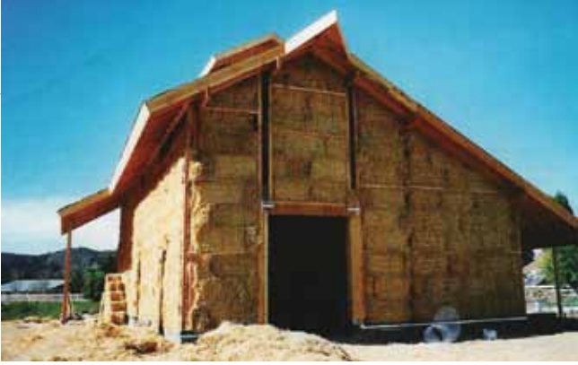
Figure 14. Non-structural straw bale walls prior to plastering.