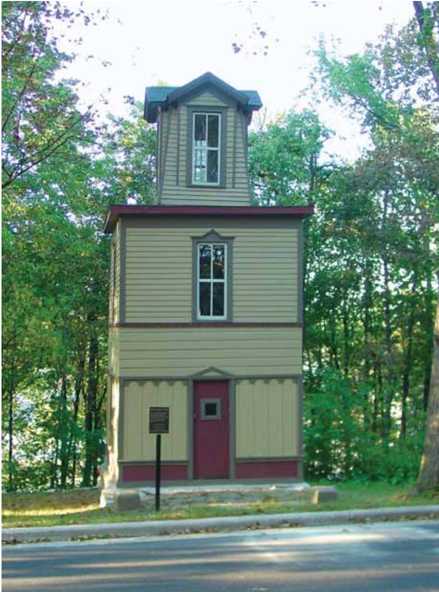
Figure 19d. Tower applications are ideal for post-frame.