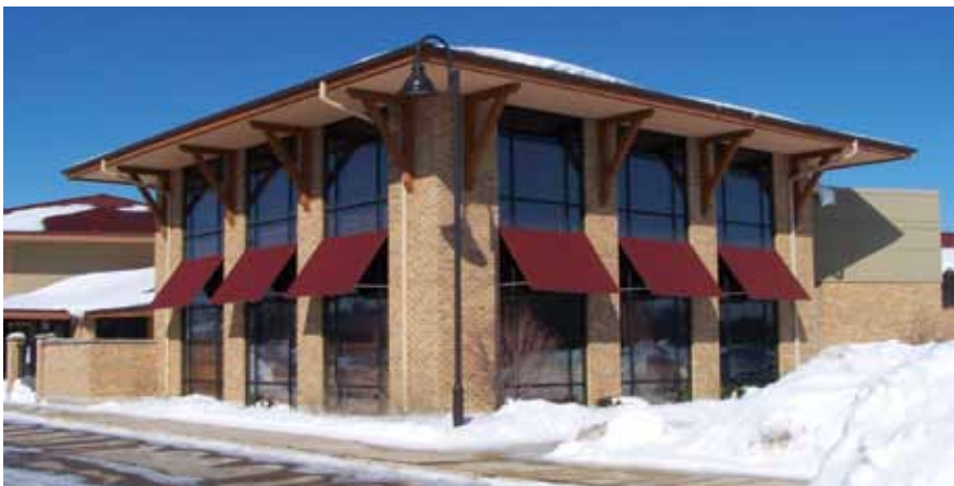
Figure 24. Tall walls, large regularly-spaced windows and wall brackets make buildings similar to this good candidates for post-frame.

addition to gravity-induced forces (a.k.a. bearing loads), these connections must resist shear forces acting perpendicular to the plane of the truss and uplift forces due to wind. Depending upon overall building design, connections may also be required to transfer bending moment.