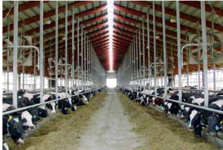
Figure 7. This building is typical of dairy freestall barns. The greater width of these buildings results in tall gable endwalls requiring substantial framing, and need for interior support posts.

Laminated posts can be fabricated to any length by splicing shorter pieces of wood together. Laminated posts are also straight and inherently more stable because of the laminating process. The only way to get a tall, relatively straight wall with