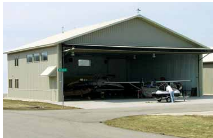
Figure 6. The ability to construct inexpensive buildings with relatively high eave heights makes post-frame ideal for many machinery storage buildings including this airplane hangar.