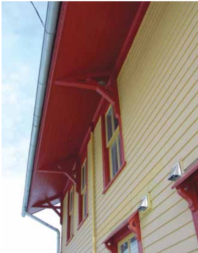
Figure 23. Wall support brackets used to support a roof overhang.