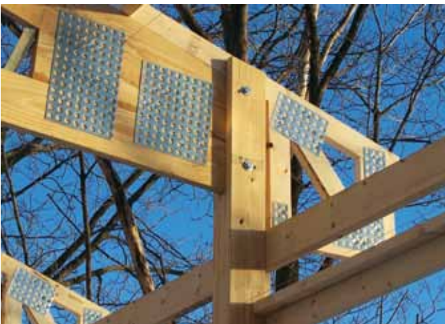
Figure 13. When truss is sandwiched between outer plies of a mechanically-laminated post, bolts are placed in double-shear for a very effective connection.

wood studs is to use more expensive, engineered lumber products (e.g., laminated strand lumber, parallel strand lumber).