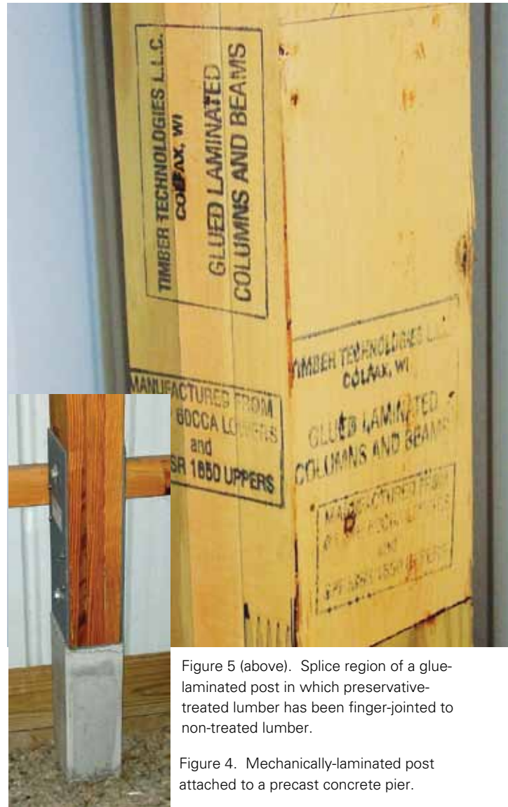
Figure 5 (above). Splice region of a glue-laminated post in which preservative-treated lumber has been finger-jointed to non-treated lumber.

Replace the doors in a mini-warehouse with large glass panels, and you can understand why post-frame is also ideal for retail stores with large glass facades (figure 2). In general, any