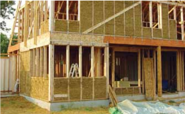
Figure 16. Clay-coated straw walls after removal of the slip forms used to pack the wet clay-coated straw into place between and on the inside of wall framing. Once plastered, these walls will be approximately one foot thick. Clay coating increases fire resistance and reduces problems with pests.