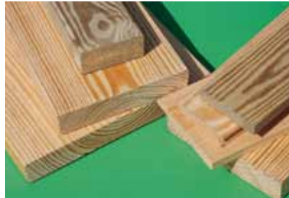
Protecting wood products from exposure to moisture requires vigilance and teamwork by all parties in the chain of custody.