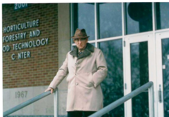
In front of Howlett Hall, OSU Campus, 1968-69