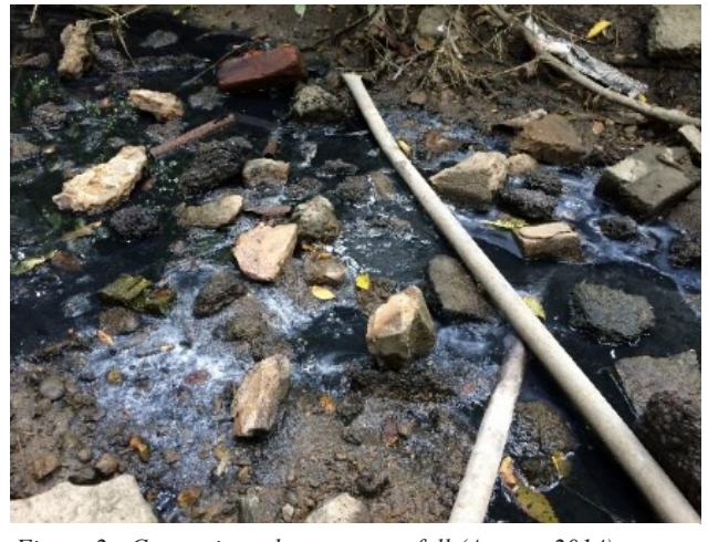
Figure 2: Contaminated water at outfall (August, 2014)