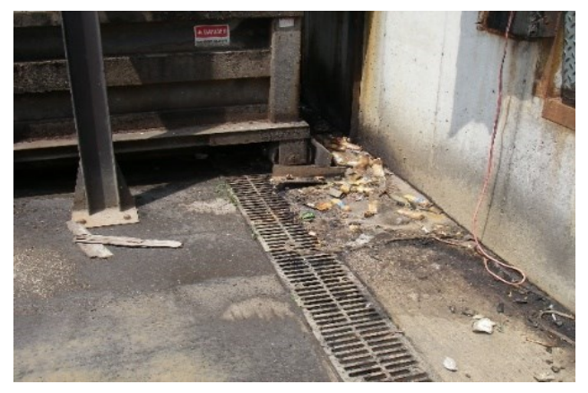
Figure 3: Garbage and leaking dumpster at trench drain (August, 2014)