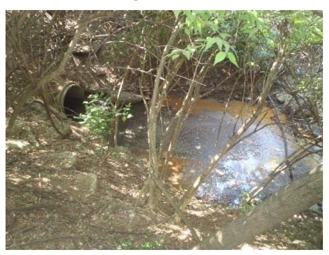
Figure 1: Contaminated water at outfall (July, 2012)

At the time of inspection, inspectors observed the trash compacting dumpster leaking and garbage on the ground (Figure 3). Further investigation showed that the dumpster needed repair to stop the leachate from leaking. The facility was issued five violations of the Ohio Uniform Food Safety Code and advised that failure to correct the issues within the allotted time frame and to remain in compliance would result in the