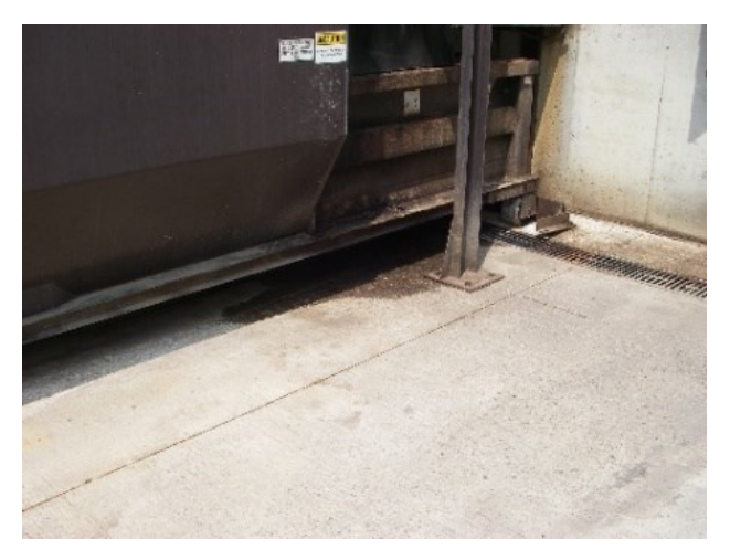
Figure 4: Cleaned up dumpster area (August, 2014)

facility being brought into Environmental Health's Food Enforcement Process. This process starts with a facility being placed on probation for six months, but can result in suspension or revocation of their license if they fail to stay in compliance with the terms of their probation.