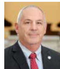
Sen. Stephen Huffman (R-Tipp City)