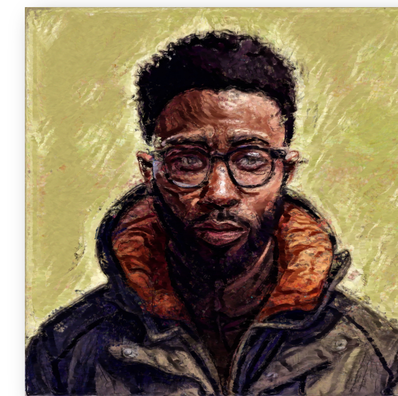
Fictional Patient #2 (AI-generated)

A 34-year-old male, H, with Persistent Depressive Disorder and Borderline Personality Disorder seeks further ways to enhance happiness during a follow-up appt. for sertraline management.