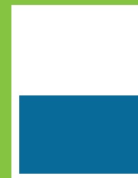
Half Page Horizontal