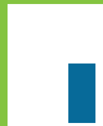
Sixth Page Vertical