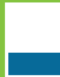
Third Page Horizontal