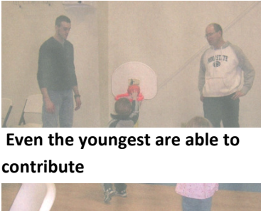
Even the youngest are able to contribute

Abiding Christ Lutheran Church, Fairborn, held a "Hoops for Nets" event on Sunday afternoon, March 6. Participants raised over $1300 for the ELCA Malaria Campaign in a variety of ways.